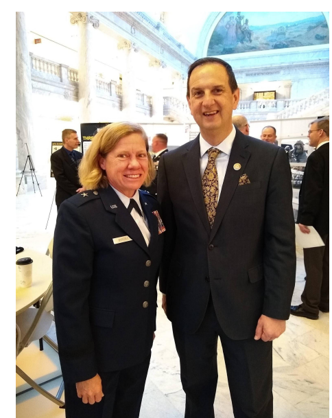
Military Appreciation Breakfast I was honored to meet General Christine Burckle of the US Air Force.