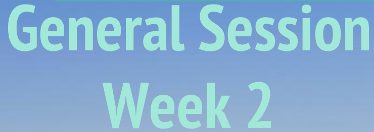
Photo Highlights for Representative Norm Thurston (02/04/19 - 02/08/19)