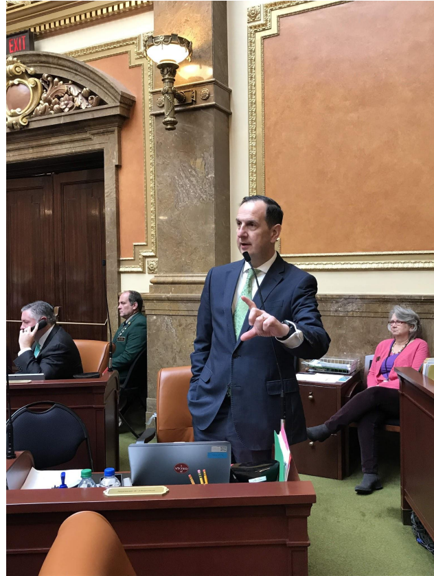
(Left) Speaking in favor of a bill on the House floor.